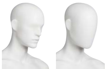
Head 01 Head 04